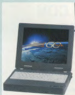
Studies indicate that communications and service providers are the key markets for ruggedized laptops like the Itronix GoBook.

In response to this trend, Itronix has introduced the GoBook, a ruggedized notebook PC with integrated wireless communications. The GoBook includes a Pentium III or Celeron CPU (central processing unit), 256 MB SDRAM (synchronous dynamic random access memory),